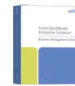
Enterprise Solutions From $3,000