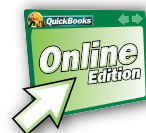
Online From $9.95 per mo.