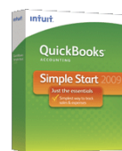
Simple Start $99.95 FREE Edition Available 1

Whether your clients are just starting out or their business is growing, there's a QuickBooks version that fits their needs.