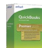
Premier From $399.95