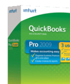
Pro From $199.95